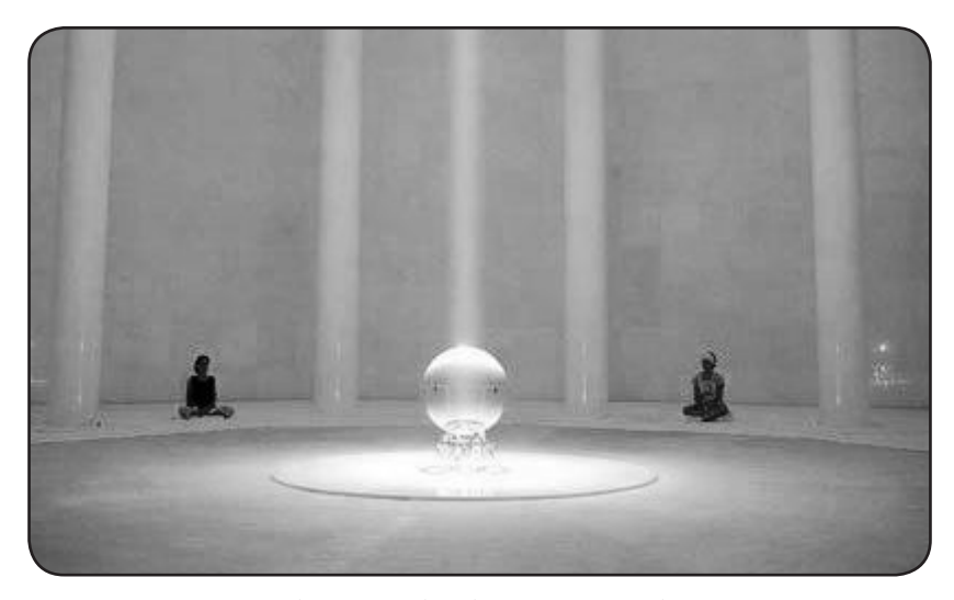
The Inner Chamber: Matrimandir